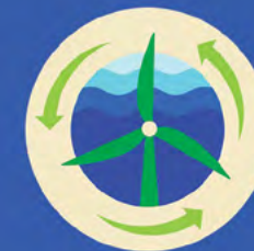
POSITIVE VALUE CHAIN